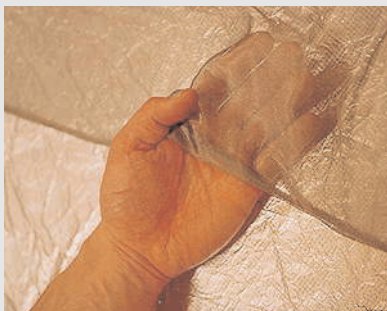
Aaronia-Shield® offers highest transparency and air permeability

The different available highly-transparent shielding systems currently on the market differ significantly with respect to protection effects and cost effectiveness and, especially at higher GHz levels, offer little protection.