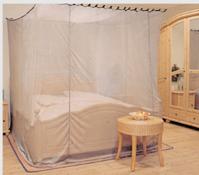
Shielding canopy made of Aaronia-Shield® and Shielding mats made of Aaronia X-Dream®

Aaronia-Shield® can conveniently be used as shielding transparent fly screen in your windows. It can also be used as high-quality shielding curtain or drapes. Aaronia offers you premium canopy systems made of Aaronia-Shield® for your beds.