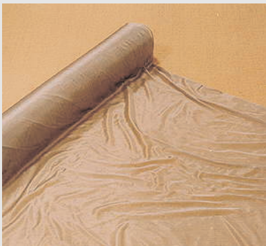
Aaronia-Shield® is antiseptic